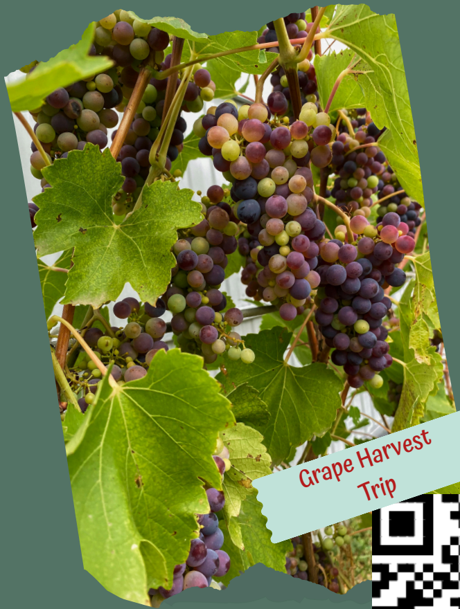
Grape Harvest Trip

A great way to explore farms when the weather isn't so inviting, or a longer trip isn't feasible, NY Ag in the Classroom has robust library of virtual trips you can share with your students! Check them out @