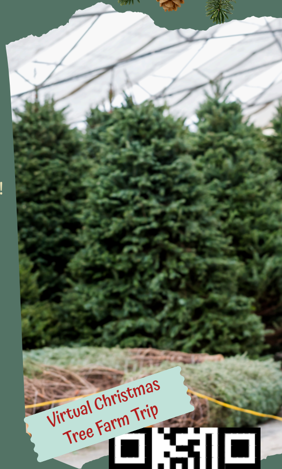
Virtual Christmas Tree Farm Trip